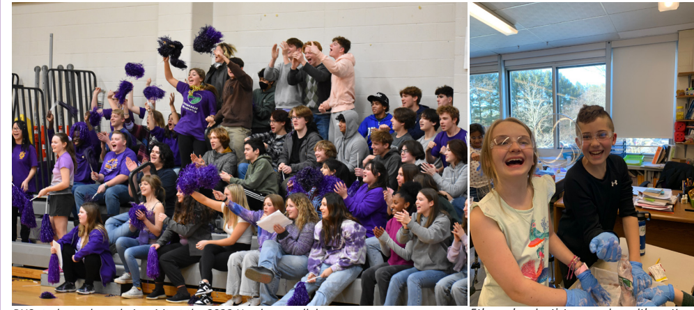
RHS students show their spirit at the 2023 Hawk pep rally!

The annual budget vote for the fiscal year 2023-2024 by the qualified voters of Rhinebeck CSD, Dutchess County, NY will be held on Tuesday, May 16 between the hours of 2-9 PM, prevailing time, in the Bulkeley Middle School Cafeteria at which time the polls will be opened to vote by voting ballot or machine.