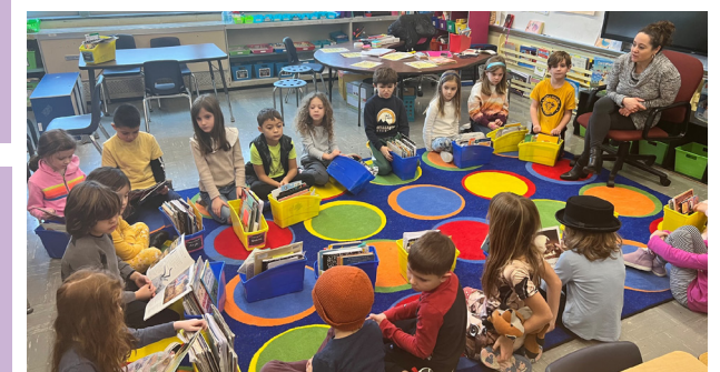
First grade readers share what they learned in their independent reading books.